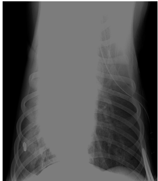
Fig. 2: Ventrodorsal (VD or AP) chest radiograph of dog showing metallic bullet in the right caudal lung lobe. The mediastinum is normal in configuration for canine radiographic anatomy, though it is shifted slightly to the right. Also note the increased opacity in the right lower lung field secondary to atelectasis (and minimal rotation).

Ventrodorsal (VD; similar to human AP) and lateral views of the chest were obtained (Fig. 1, Fig. 2). Note the intact bullet on the right side and the chest tube on the left. This transmediastinal penetration resulted in a pneumopericardium, sparing the great vessels. There is a small amount of air in the anterior (cranial) ventral thorax and atelectasis of the right caudal lung lobe. There is increased separation between the heart and the sternum (larger arrows in Figure 1) owing to the atelectasis of the dependent right caudal lung lobe. Rightward mediastinal shift is seen in the VD view, and surgical staples are visible in the left lateral chest wall.