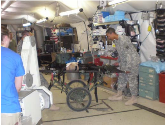
Fig. 3a: Our patient in the Emergency Department at Balad, Iraq on a NATO litter, intubated, anesthetized and stabilized with IV fluids.

Military Working Dogs play a vital and often unheralded role in our national defense. The Department of Defense (DoD) spends significant time and money on the training of these animals to perform tasks for which they are simply biologically better equipped for than any human or machine, such as sentry duty and explosives detection. These dogs are out there on the front lines, obediently performing the tasks for which they've been trained, and saving soldiers' lives with every explosive they detect and early warning sign they give. For that reason, they are force multipliers. It is therefore in the interest of the mission that prompt medical care in the event of traumatic injury be as much of a priority for these MWDs as it would be for any other downed soldier (Fig. 3). And if the veterinarian isn't around, the task may fall to you, Doc.