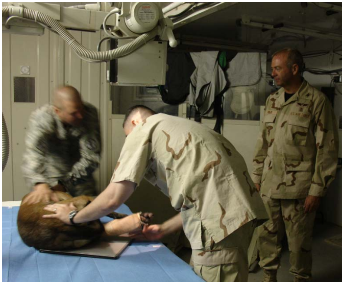
Fig. 4: Positioning of another MWD in an isoshelter (deployed plain radiography unit). This dog was getting a radiograph of the hind extremity.

Recommendations for radiological imaging of MWDs are published in The Handbook of Veterinary Care and Management of the Military Working Dog . 7 Some important procedural differences to keep in mind are that chest and abdominal images for dogs are ventrodorsal and lateral (right lateral thoracic view) instead of anterior/posterior and lateral (Figure 4). Positioning the dog for the VD image will require help; dogs cannot abduct their limbs, but someone can extend and hold the limbs away from the trunk, minimizing their supposition on the image. Either side may be used for the lateral views if the area of interest is the thorax, and if need be, a dorsoventral view may suffice instead of a ventrodorsal view. If you're also looking at the abdomen, the right lateral view is preferred for visualization of the stomach and liver. When possible, both laterals are ideally obtained.