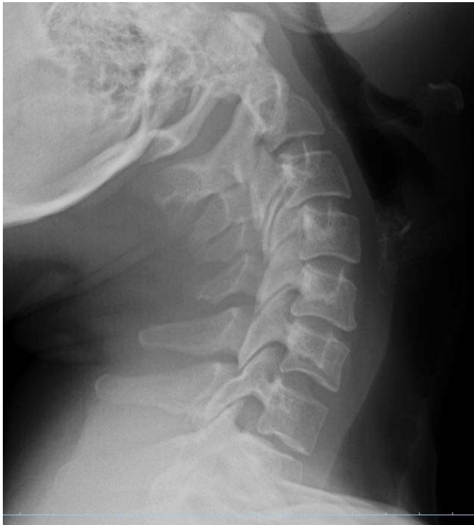
Fig. 3. Extension lateral c-spine with retrolithesis of C3-C4.

definitive way, and there was no evidence of metastatic disease.