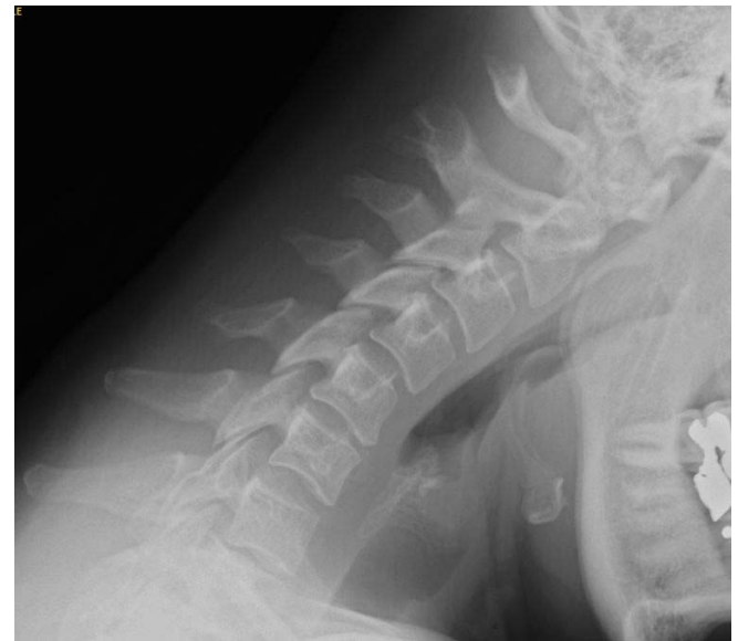
Fig. 4. Flexion lateral c-spine, neutralizing the subluxation seen on extension lateral.

There was no history of penetrating injuries or camping or exotic travel (other than New Zealand and Fiji). The patient may have contracted during her surgical residency - the hospitals she trained in NYC were fairly old. M. xenopi has been found to colonize the steam outlet valves of hospital hot water heaters. The cervical spine findings, although real, were not the root cause of the symptoms in this patient. See figures 3 and 4 for plain cervical spine