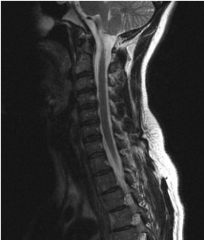
Fig. 6. Sagittal T2 weighted MR showing discs bulges at C3-4 through C5-6, without evidence of frank herniation.

Category 1 CME or CNE can be obtained on the MedPix™ digital teaching file on similar cases by opening the following link. Many Radiology Corner articles are also a MedPix™ Case of the Week where CME credits can be obtained.