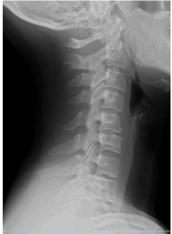
Fig. 5. Neutral lateral cervical spine with straitening, likely due to positioning and/or spasm.

disease: one cavitory mass, one cavitory nodule, three consolidations with multiple cavities, and two cavities only. One patient demonstrated upper lobe consolidation only." 6