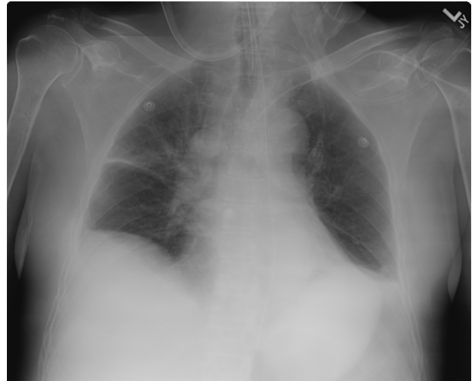
Fig. 1A. Chest radiograph from hospital day one shows lungs that are adequately inflated with bilateral costophrenic angle blunting representing small pleural effusions. Right lung fissure thickening represents fluid.

An 84-year-old male presented to the emergency department with lethargy, dehydration, pallor and right upper quadrant pain. His medical history is significant for chronic pyuria, hypertension, chronic obstructive pulmonary disease and dementia. Blood pressure on presentation was 96/58, heart rate was 126 beats per minute and temperature was 98.6 F. On pulmonary exam the patient had crackles in the anterior and posterior lung fields, which were most pronounced in the posterior basilar segments. Laboratory analysis of urine revealed a urinary tract infection (UTI). Complete Blood Count (CBC) showed a white blood cell (WBC) count of 24,000 cells/mm 3 . AP Chest radiographs were obtained on day 1 (Fig. 1A) and day 2 (Fig. 1B) of hospitalization.